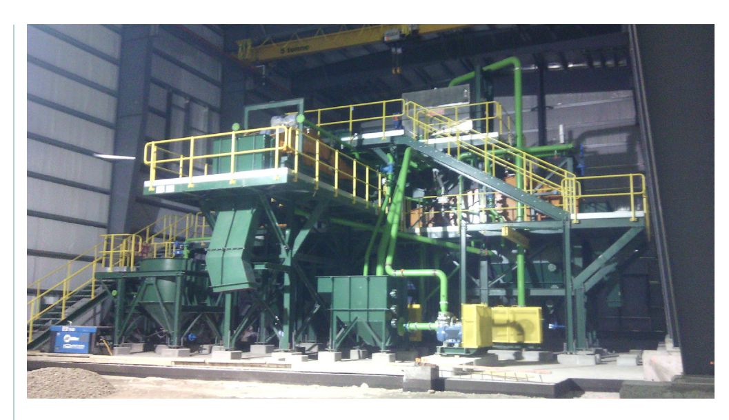
CFI's Dense Media Separator (DMS). Work on the DMS was completed in January. The DMS will help separate fluorspar from other minerals.

This month, vegetation was cleared for the path of the town bypass road, which will start construction once insurance procedures are in place. CFI will continue to provide updates on road construction developments as they happen.